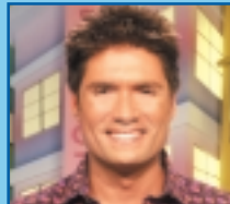
Louis Aguirre of Deco Drive